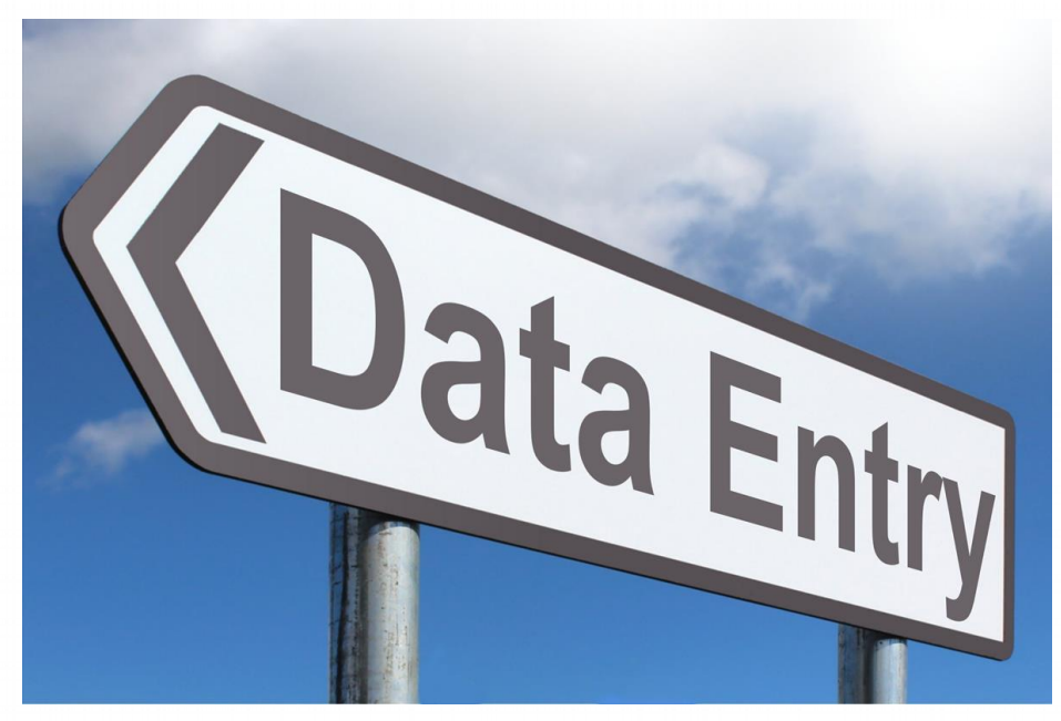
Data Entry by Nick Youngson CC BY-SA 3.0 Alpha Stock Images